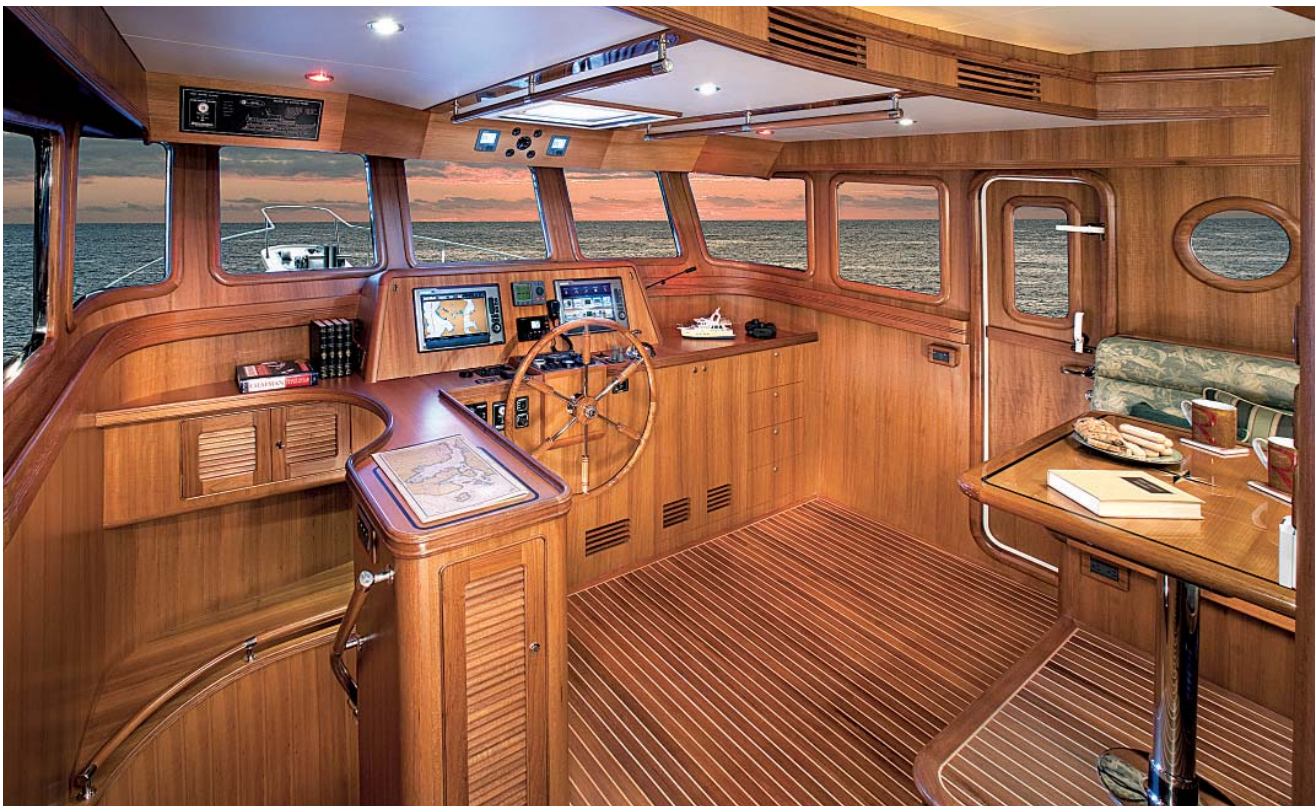
Top: The U-shaped galley is blessed with loads of stowage above and below the flawless granite countertops and serving bar. Above: Visibility from the pilothouse is excellent for the helmsman and crew, with plenty of room for an optional Stidd helm chair.