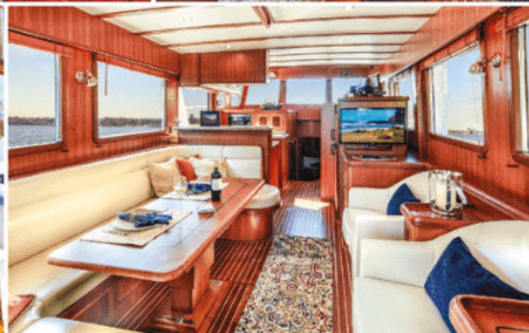
The main deck of the Selene 50 Europa is surrounded by windows, making the teak interior naturally bright by day. The usable space in the engine room has benefited from the "deep hull" design that extends the waterline slightly.

landing at the foot of the stairs from the helm. To port is a double berth — cozy for two — that has a hanging locker, a nightstand and private access to the second head (and access to the engine room). The stateroom to starboard features separate single berths and a hanging locker.